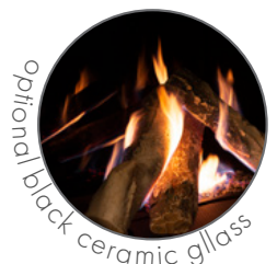
optional black ceramic glass

The vertical campfire burner introduces a classic fire design to your interior. It is decorated with ceramic logs, vermiculite, slate chips and glowing fiber. As an option you can choose an elegant high-gloss black ceramic glass for the back wall.